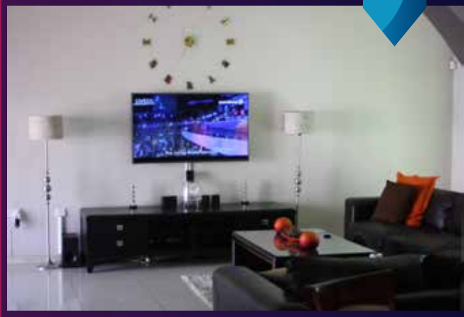
Fully furnished lounge, DSTV, Home theatre